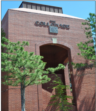
Collonade Executive Suite