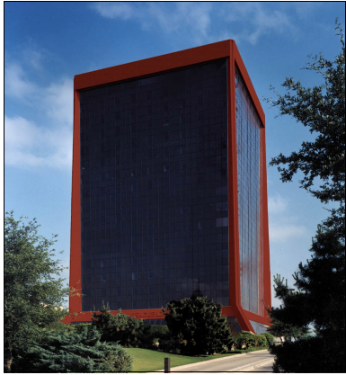
Union Plaza Business Center